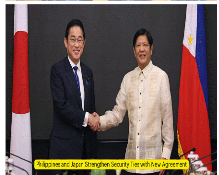
Philippines and Japan Strengthen Security Ties with New Agreement

(A) Philippines and Japan have taken a big step in their security. They have signed a new agreement that allows their military forces to enter each other's countries more easily. This comes at a time when concerns are rising in the Indo-Pacific region. This is an agreement that makes it easier for the military forces of both the countries to visit each other.